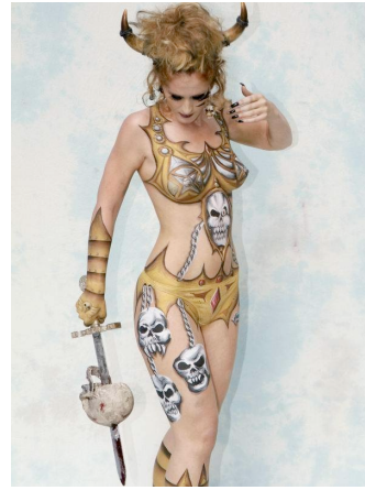
Nicola - An artists rendition

Travel to the lunar Empire is a Startling and Overwhelming experience that leaves you wondering how to conduct yourself in a Ladylike Manner whilst retaining your virtue and your dignity. There will be many unexpected advances upon your person and learning to decline them gracefully can be something of a challenge.